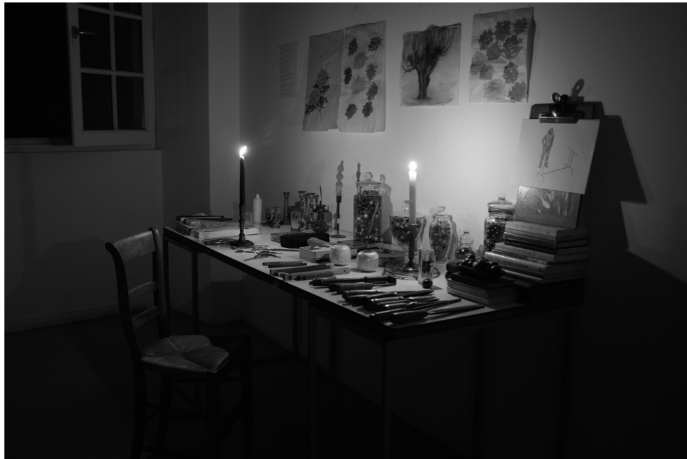
Looking for Maltaverne (Recollets, Paris), 2021, © Wei-Li Yeh

Opening on 13th November 2021, from 3pm to 9pm