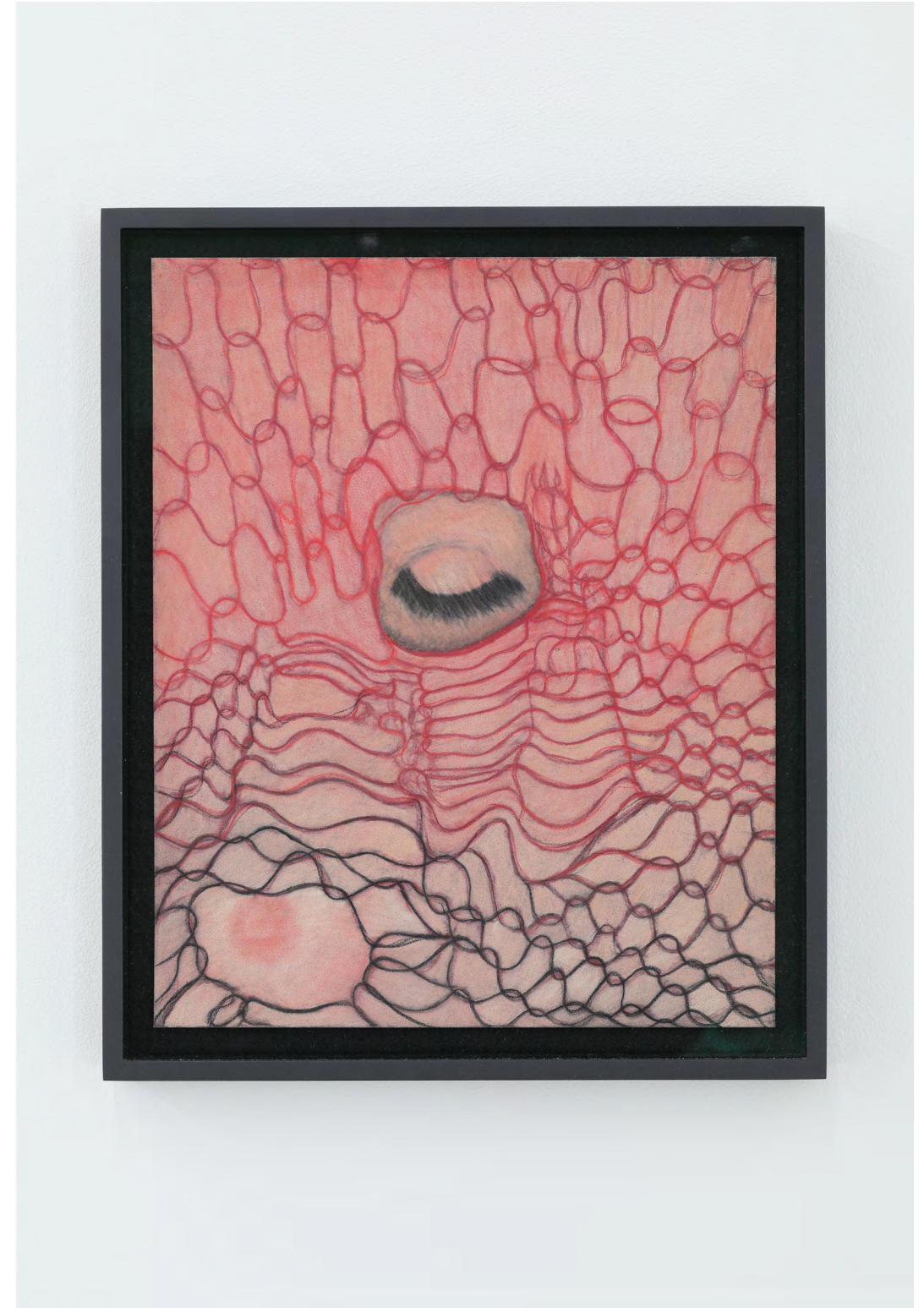
Untitled , 2022, Rebecca Ackroyd, installation view, Centre d'Art Ygrec-ENSAPC, Aubervilliers. Courtesy Peres Projects © Objets pointus 2022