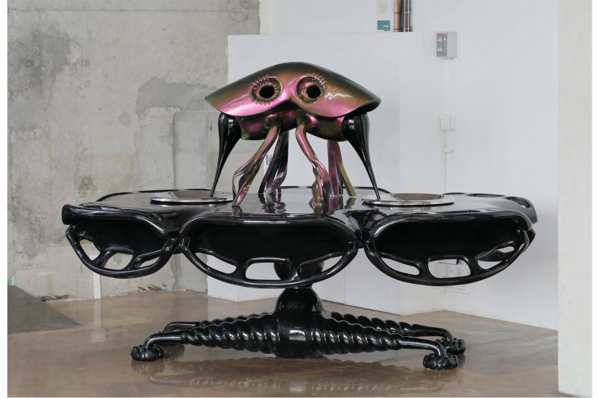
It's Fantastic (Night's end administrator) + Happy perfumer, 2020, Villard & Brossard, installation view, Centre d'Art Ygrec-ENSAPC, Aubervilliers © Objets pointus 2022