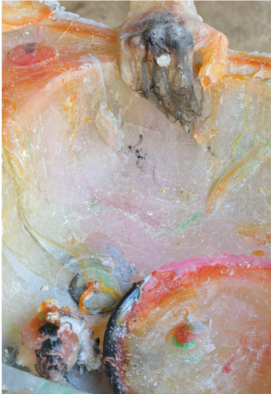
Playing alone , 2022, Rebecca Ackroyd, close-up view, Centre d'Art Ygrec-ENSAPC, Aubervilliers.