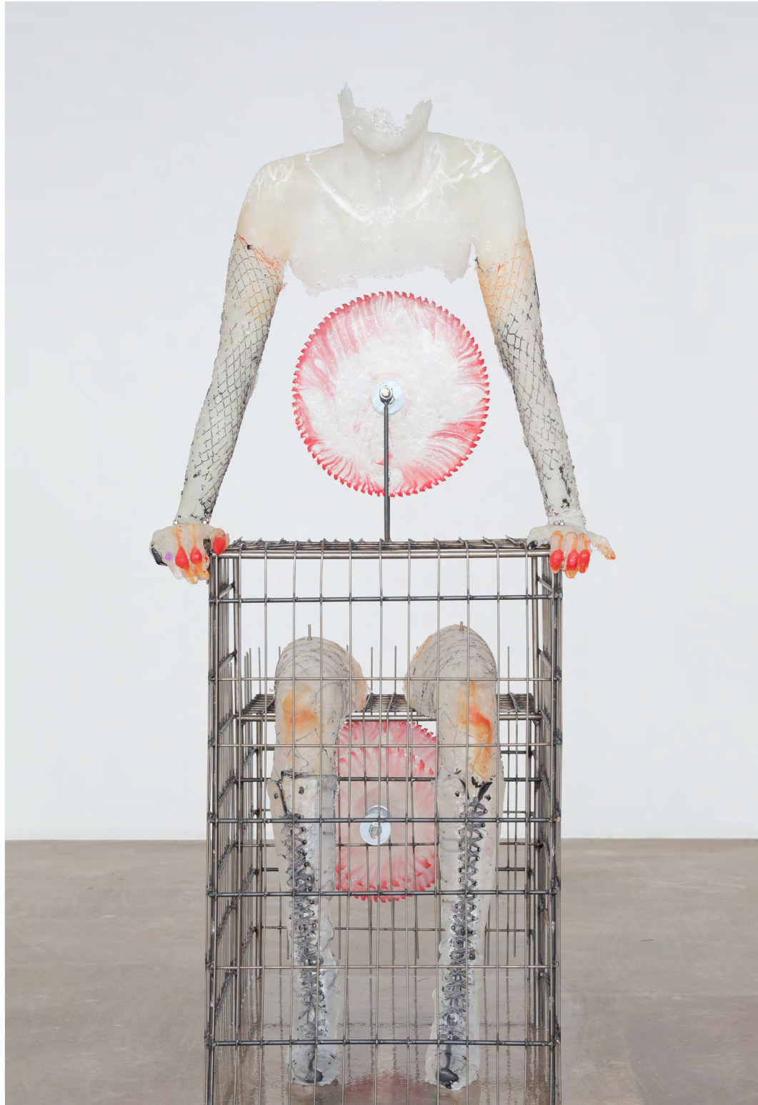
Fertile ground , 2022, Rebecca Ackroyd, installation view, Centre d'Art Ygrec-ENSAPC, Aubervilliers. Courtesy Peres Projects © Objets pointus 2022