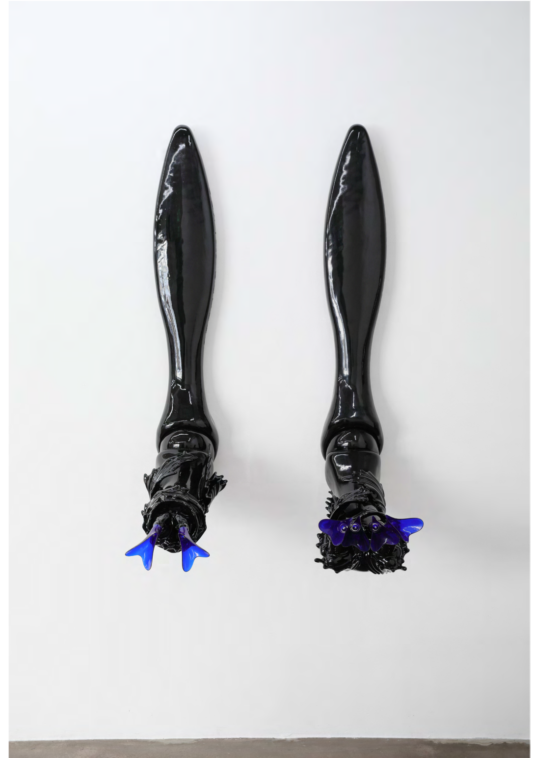
Luster purge (tour guide from the underworld) , 2022 (left) Decode Talker (darkworld morning star) , 2022 (right) Villard & Brossard, Ygrec-ENSAPC, Aubervilliers © Objets pointus 2022