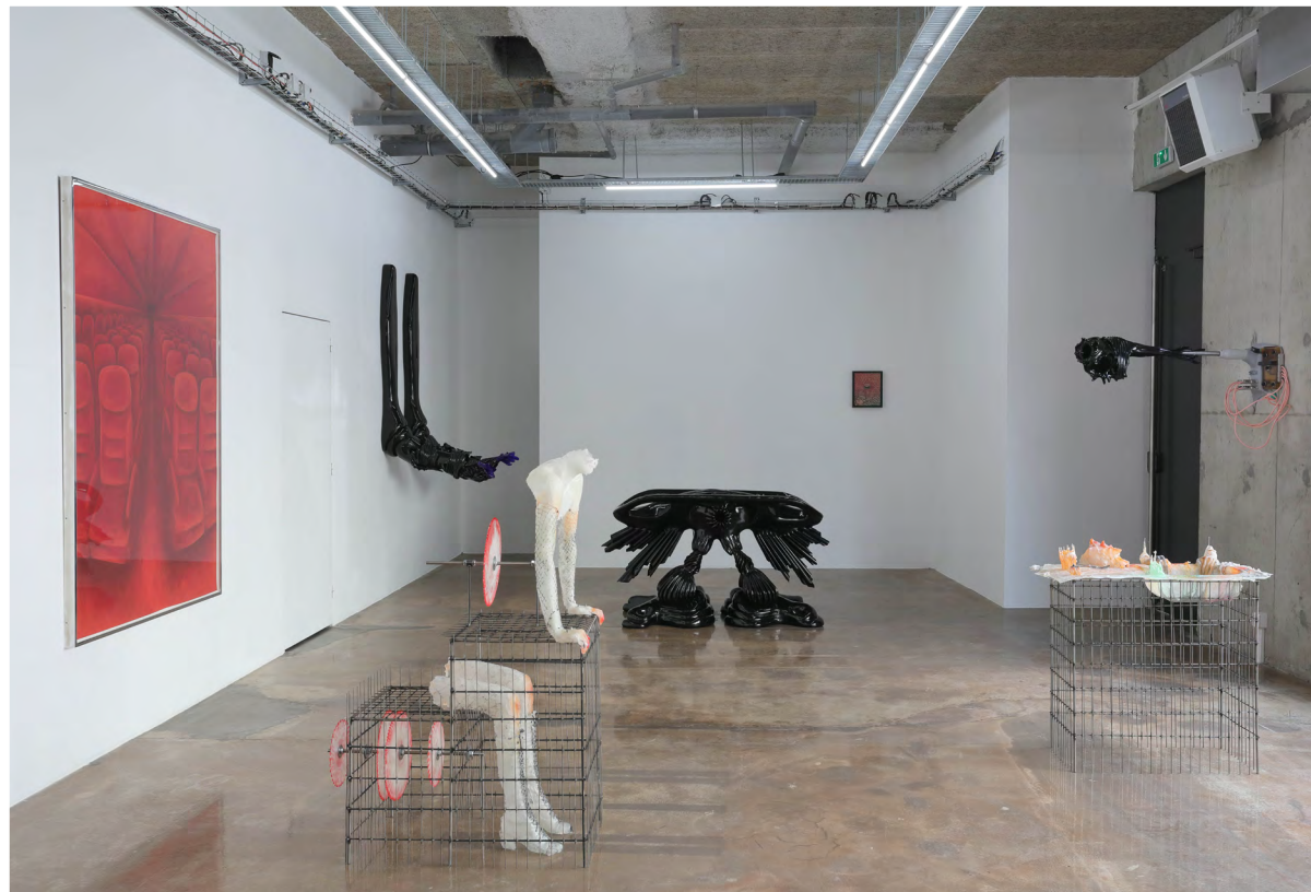
Masters and Servants, installation view, Centre d'Art Ygrec-ENSAPC, Aubervilliers © Objets pointus 2022