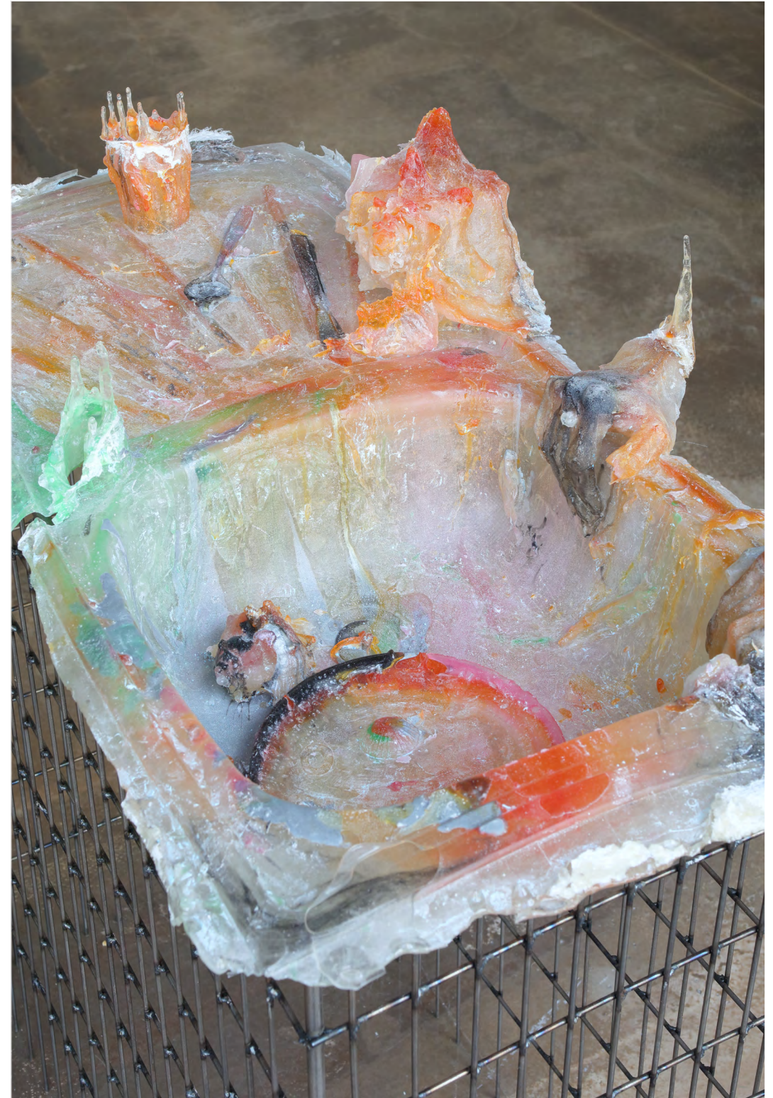
Playing alone , 2022, Rebecca Ackroyd, close-up view, Centre d'Art Ygrec-ENSAPC, Aubervilliers.