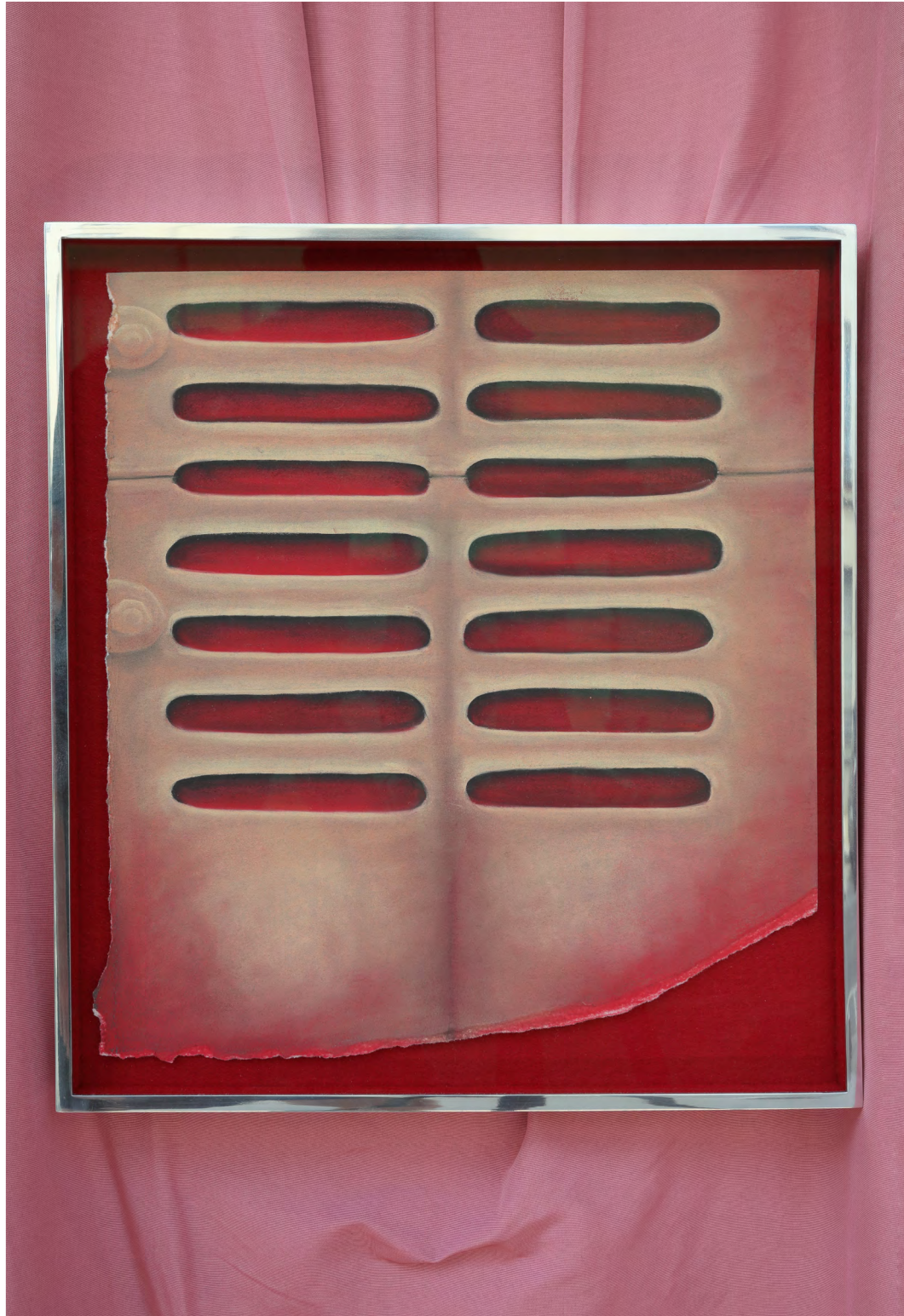
Breath taking, 2020, Rebecca Ackroyd, installation view, Centre d'Art Ygrec-ENSAPC, Aubervilliers. Courtesy Peres Projects © Objets pointus 2022