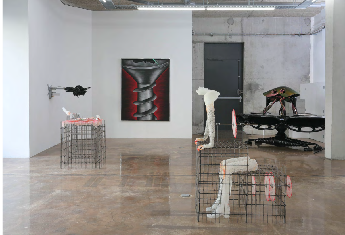
Masters and Servants, installation view, Centre d'Art Ygrec-ENSAPC, Aubervilliers