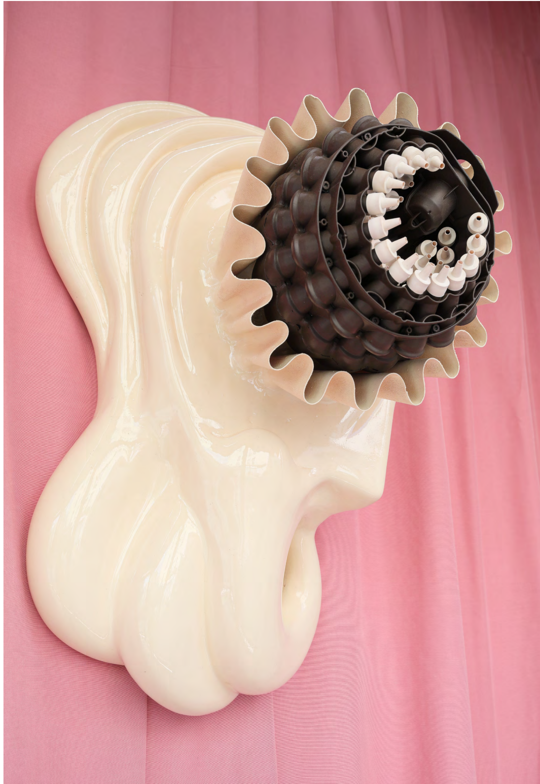
Amplifier Chorus I , 2022, Villard & Brossard, installation view, Centre d'Art Ygrec-ENSAPC, Aubervilliers