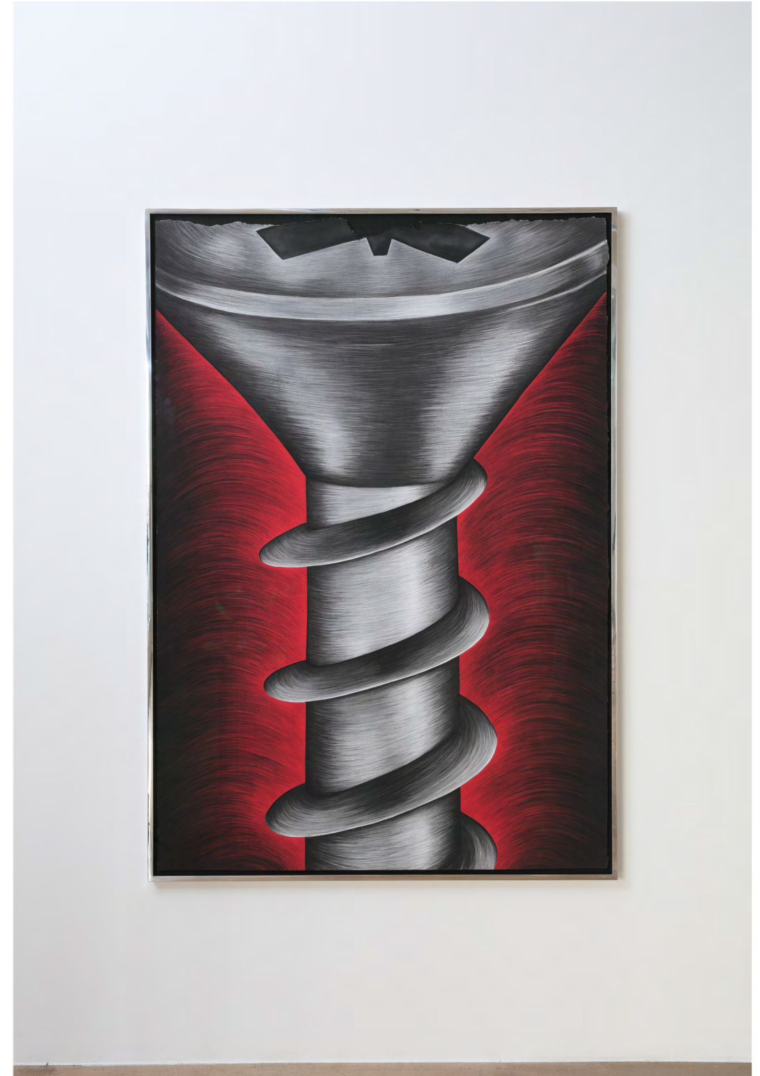
Boring content , 2022, Rebecca Ackroyd, installation view, Centre d'Art Ygrec-ENSAPC, Aubervilliers.